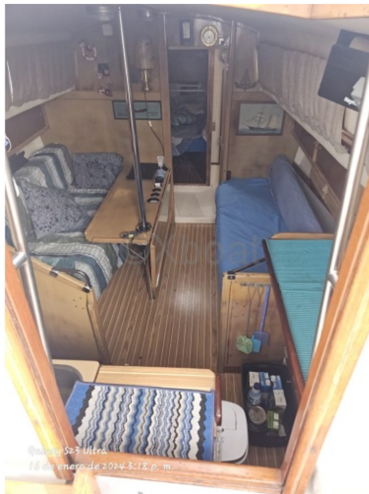
Quinty S23 Ultra 16 de enero de 2024 3:18 p. m.