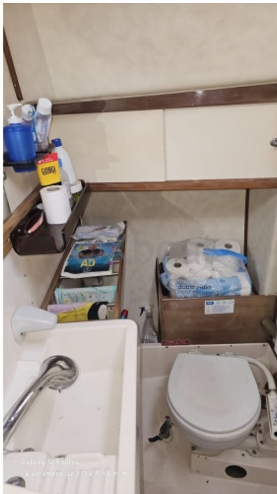
Galaxy S25 Ultra 6 de enero de 2024 9:14 a. m.