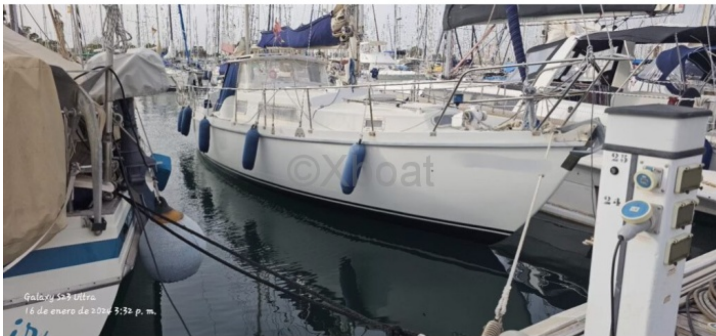
Galaxy 523 Ultra 16 de enero de 2024 3:32 p. m.