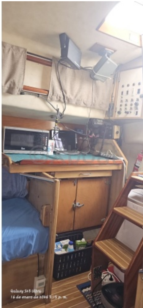
Galaxy S23 Ultra 14 de enero de 2024 5:15 p. m.