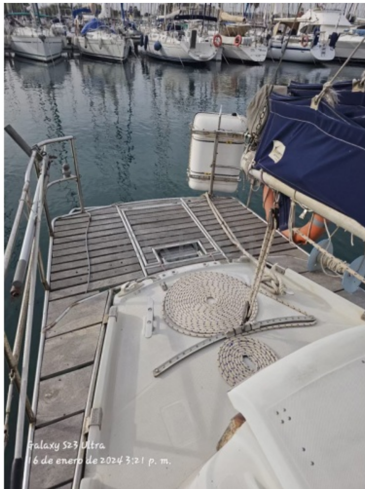
Galaxy S23 Ultra 16 de enero de 2024 3:21 p. m.